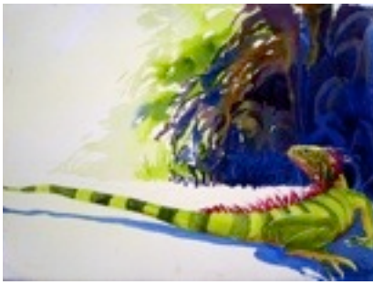
Iguana Alert