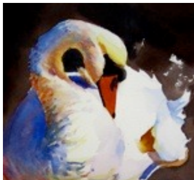
Preening , Jan Hart - Glazing pigments plus Ultramarine Blue & Burnt Sienna

Workshops for 2011 are finished - and we're looking ahead to 2012!